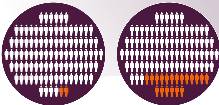
Aged 65 to 69

The biggest risk factor for dementia is age. The older you are the more likely you are to develop the condition, but it is not an inevitable part of ageing.